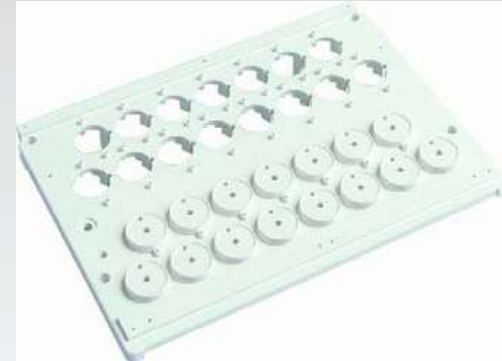
Parts for sewing machines