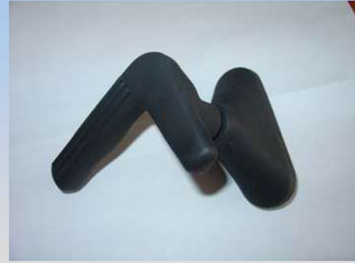
Handle of Vehicle window