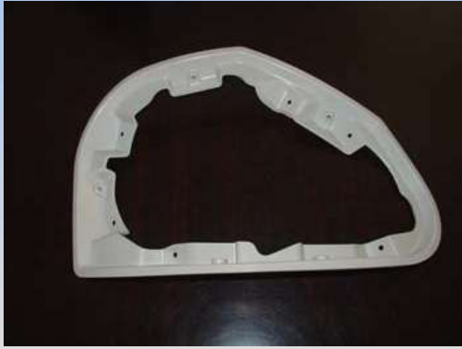
Frame for Vehicle lamp